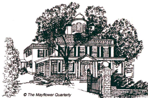
The General Society of Mayflower Descendants Headquarters 4 Winslow Street, Plymouth, Massachusetts